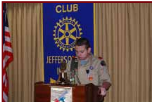
ABOVE: Troop 1 Member speaks at Jeffersonville Rotary Club BELOW: Troop 1 does flag honor guard

For more information on the troop, visit www.bsatrop1.us , one of the top rated Boy Scout troop websites in the nation. The website also features several documents, photographs and videos on the history of Scouting in our area.