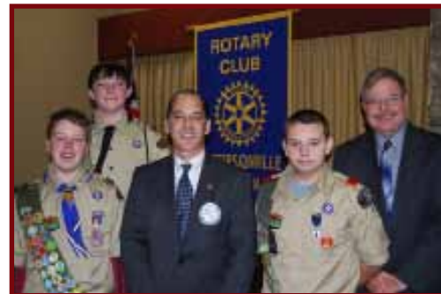
ABOVE: Members of Troop 1 at Jeffersonville Rotary Club BELOW: Scouts give history presentation.