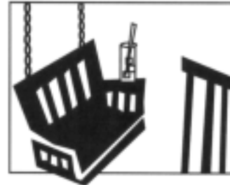
FRONT PORCH TUESDAYS

For more information about Front Porch Tuesdays as well as see pictures of how easy it is to participate, check out www.frontporchtuesdays.org .