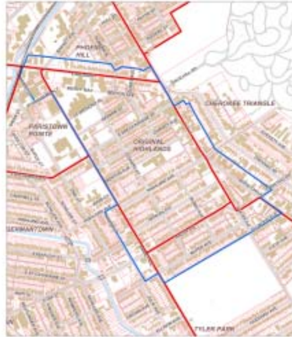
Original Highlands Neighborhood Plan Study Area

Come be part of the solution. The OHNA has monthly meetings. The board currently meets the third Monday of every month.